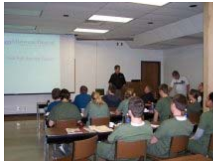
OUCOD Lunch and Learn